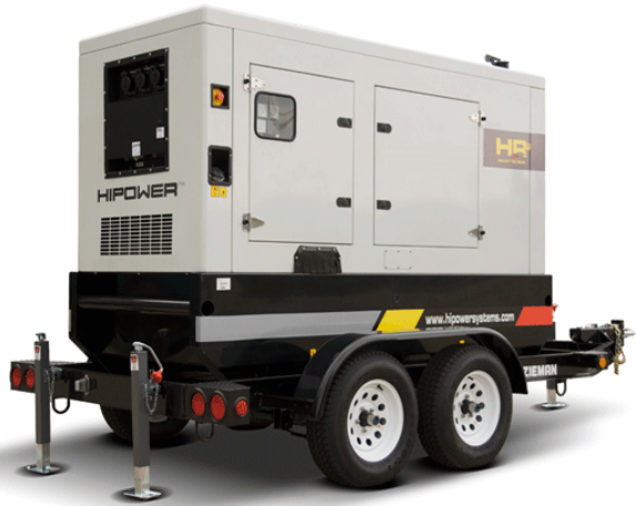
Photo depicts a typical model but may not include options such as trailer.