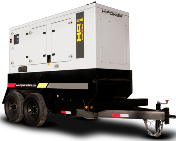
Photo depicts a typical model but may not include options such as trailer.