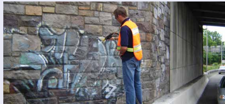
The F250MAX is the ideal size for spot cleaning and smaller projects.

Your local authorized Farrow System ® dealer: