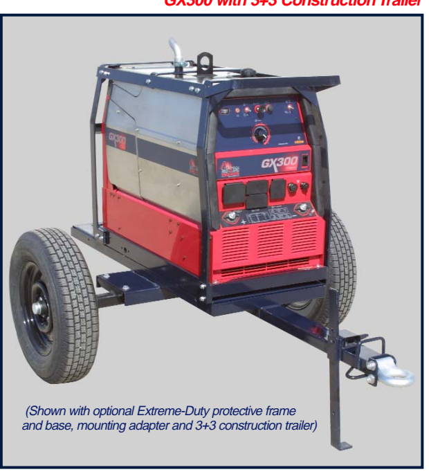
GX300 with 3+3 Construction Trailer