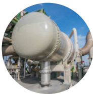
PRESSURE VESSELS AND BOILERS