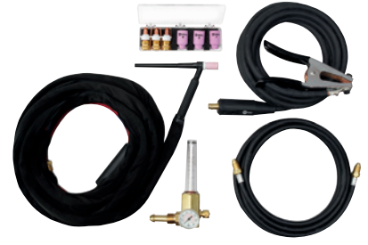
300185 kit shown.