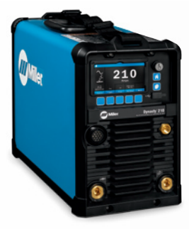
Dynasty 210 Machine only